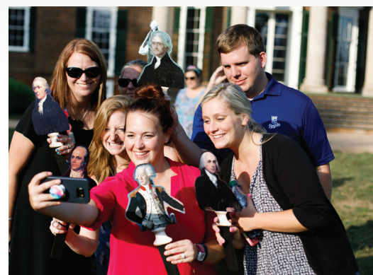
Barringer Research Fellows, 2017